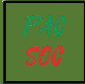
Palestinian Arts And Culture Solidarity Collective

PPAN participated in numerous networking meetings and conferences throughout 2025, the most significant of which were: