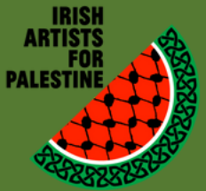
IRISH ARTISTS FOR PALESTINE

PPAN participated in numerous networking meetings and conferences throughout 2024, the most significant of which were: