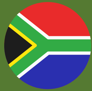
SOUTH AFRICA PALESTINE ARTS & CULTURE COALITION