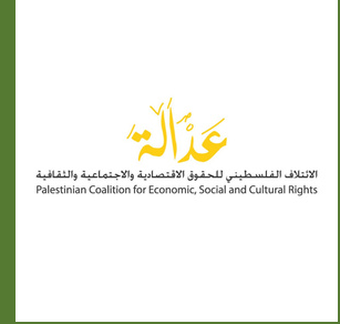
PALESTINIAN COALITION FOR ECONOMIC, SOCIAL, AND CULTURAL RIGHTS (ADALAH)