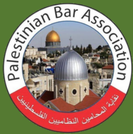
PALESTINIAN BAR ASSOCIATION